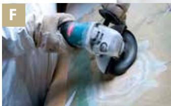
F Sanding out repairs