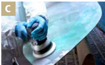
C Keying of joints