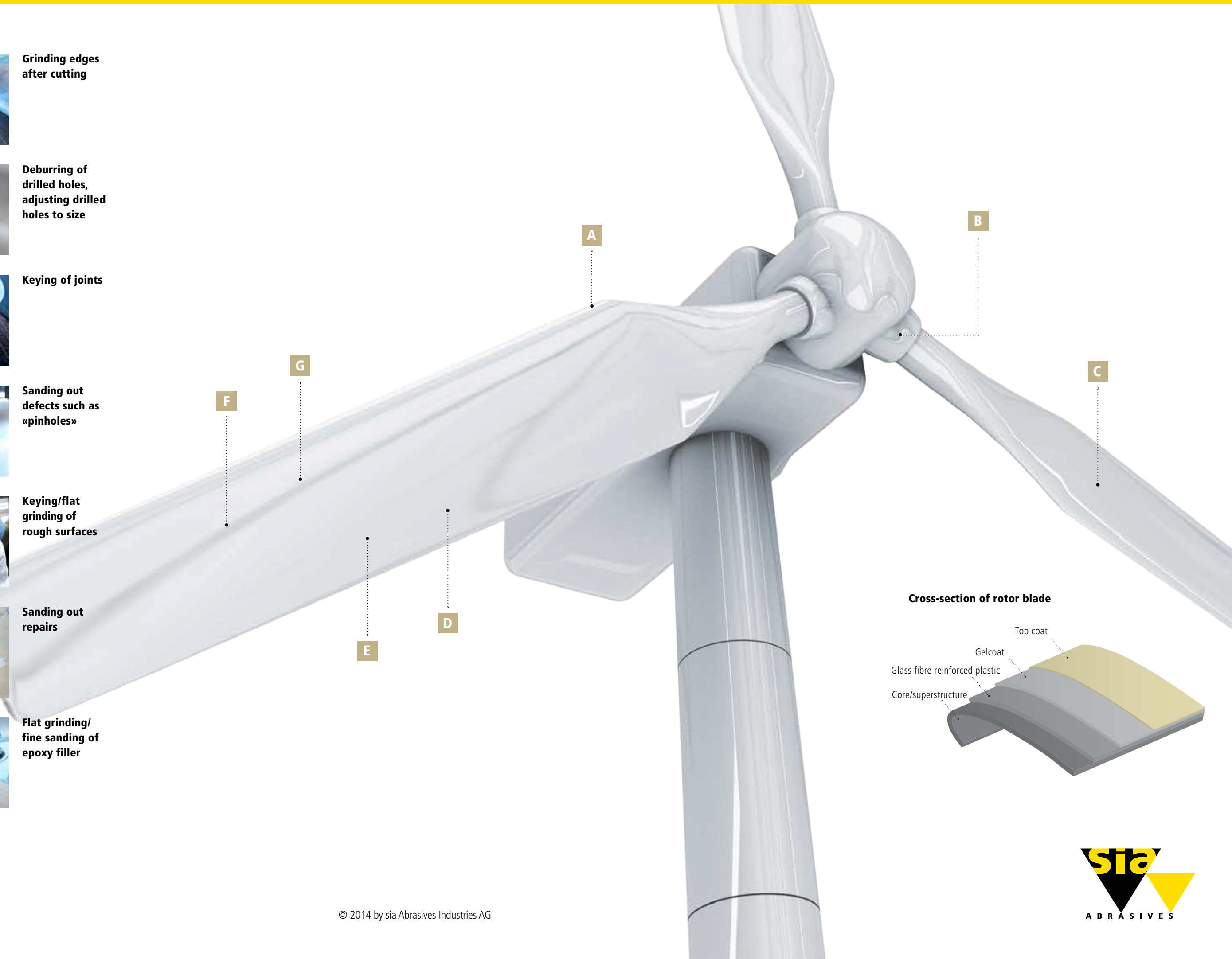
Cross-section of rotor blade