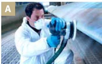
A Grinding edges after cutting