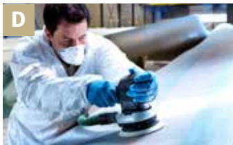
D Sanding out defects such as «pinholes»