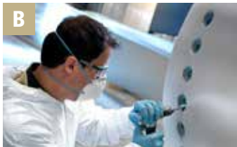
B Deburring of drilled holes, adjusting drilled holes to size