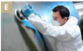
E Keying/flat grinding of rough surfaces