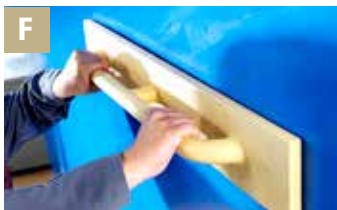
F Flat grinding of large areas