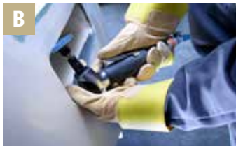
B Deburring of edges in hard-to-reach places