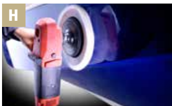
H Polishing/finish for a high-gloss finish