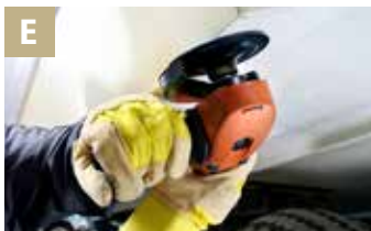
E Removing osmosis