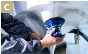
C Coarse sanding of primer filler/gelcoat