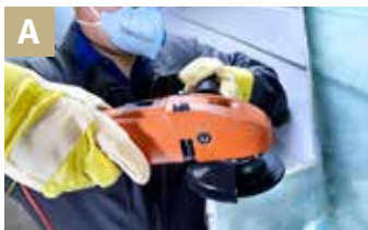
A Deburring the casting mould edge