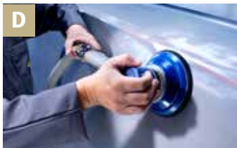
D Fine sanding of primer filler/gelcoat