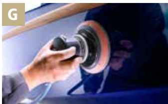
G Microfinishing prior to polishing