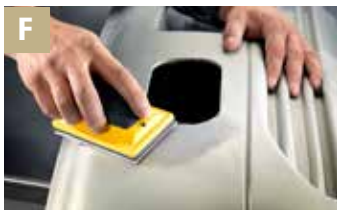
Sanding of filler