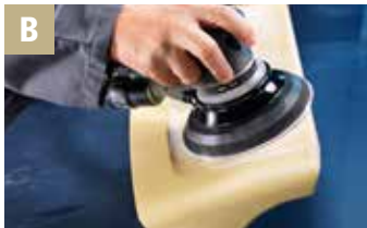
Keying a new part